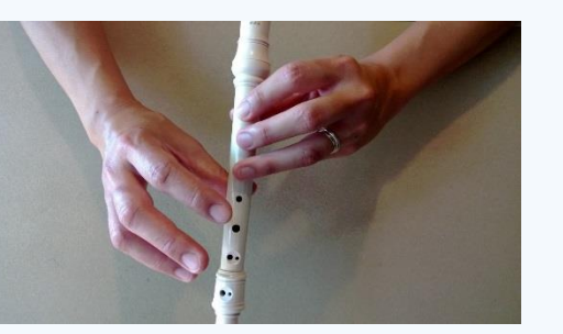
Left Hand Fingers: Front: Pointer, Middle & Ring Back: Thumb