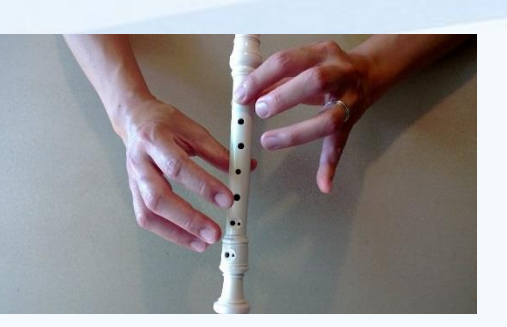
Left Hand Fingers: Front: Pointer Back: Thumb