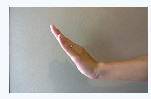
Note A (Re)